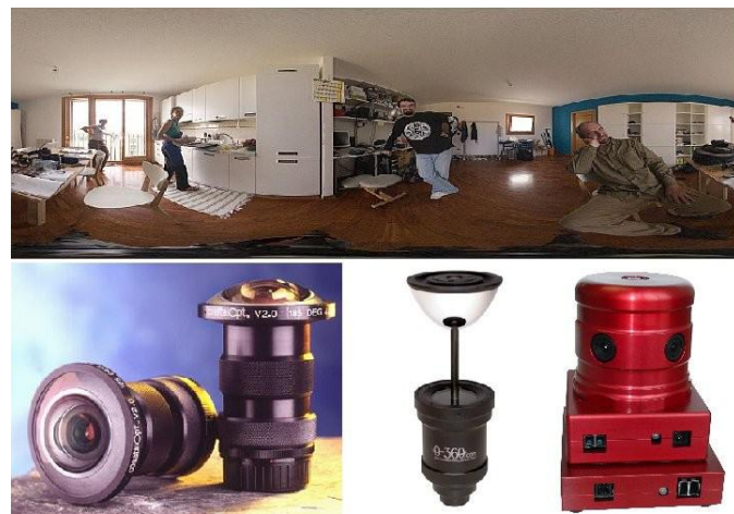
Fig. 2 Top: image of an omnidirectional camera (unwarped). Bottom: Three types of omnidirectional cameras: left: fish-eye lens, middle: Catadioptric camera, right: Combined spherical camera

An omnidirectional camera has the advantage that only one is required in each room, however there are also some problems that should be considered. The camera has to be attached to the ceiling in the middle of the room. Often also the chamber lighting is situated there. This can in some cases obstruct the sight, or cause over-illumination in case the light is directed to the camera. In case of a fall right next to an obstruction, like a table, the person can be completely occluded by the obstacle. Fig. 2 shows an image taken with an omnidirectional camera. It also shows pictures of the different kinds of omnidirectional cameras.