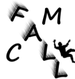
Fig. 1 FallCam logo

The next section describes the goal and the structure of our ongoing research. Section 3 deals with the different kinds of cameras, processing systems and other considerations for building a camera system. It also describes our current approach. Finally section 4 describes the structure of a fall detection system and the changes we plan to introduce.