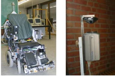
Figure 1: Left: the robotic wheel chair platform. Right: the omnidirectional camera, composed by a color camera and an hyperbolic mirror.

University of Leuven, Belgium University of Leuven, Belgium ETH Zürich, Switzerland